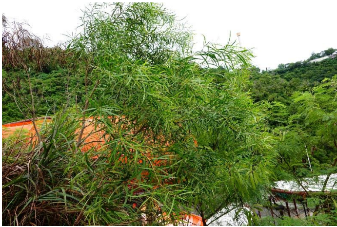
Photo 1 – Representative photo of the proposed planting species, Acacia confusa .