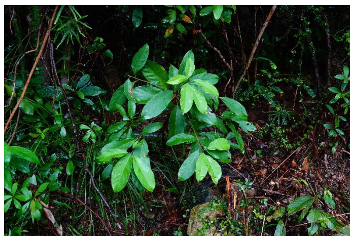
Photo 12 – Representative photo of the proposed planting species, Sterculia lanceolata .