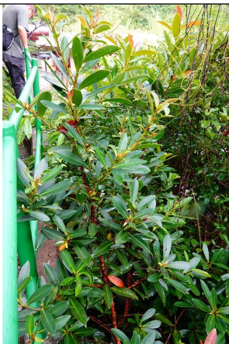
Photo 9 – Representative photo of the proposed planting species, Polyspora axillaris .