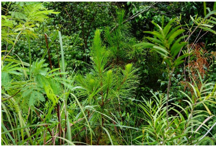
Photo 3 – Representative photo of the proposed planting, Pinus massoniana .