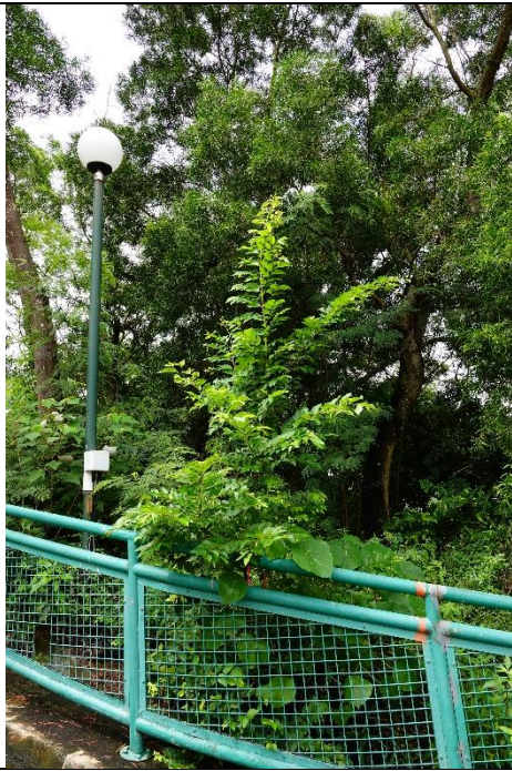
Photo 13 – Representative photo of the proposed planting species, Celtis sinensis .