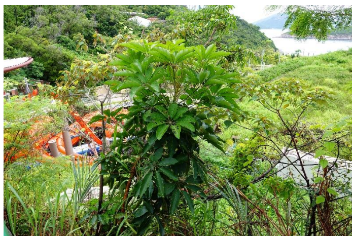
Photo 11 – Representative photo of the proposed planting species, Schefflera heptaphylla .