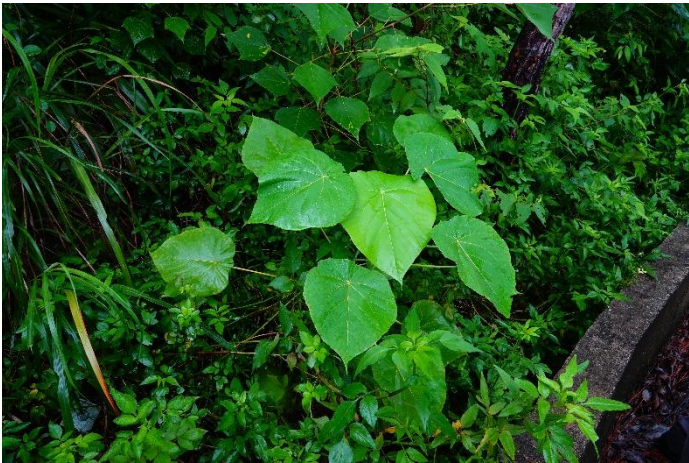
Photo 7 – Representative photo of the proposed planting species, Macaranga tanarius var. tomentosa .