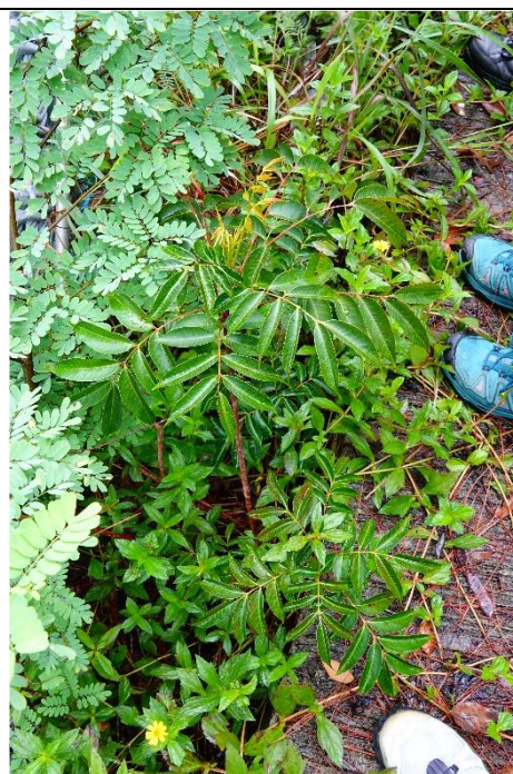
Photo 10 – Representative photo of the proposed planting species Rhus succedanea .