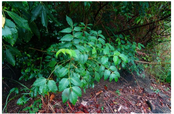
Photo 4 – Representative photo of the proposed planting species, Brucea javanica .