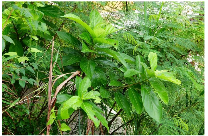
Photo 2 – Representative photo of the proposed planting species, Ficus hispida .