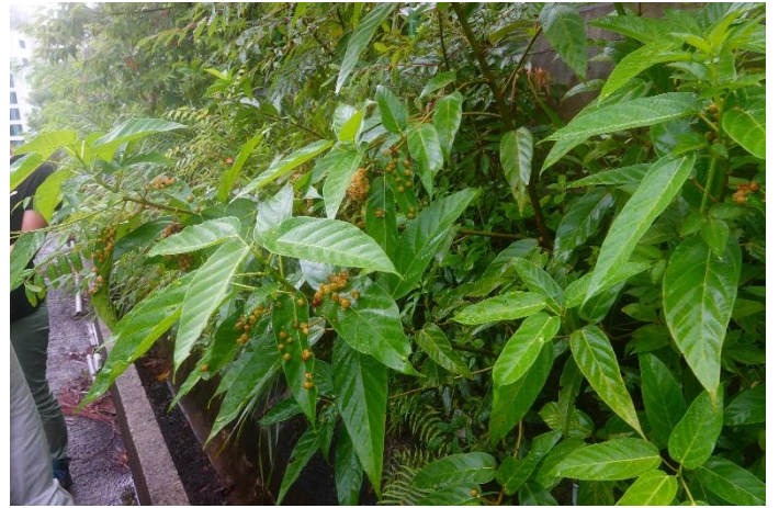
Photo 6 – Representative photo of the proposed planting species, Ficus variegata .