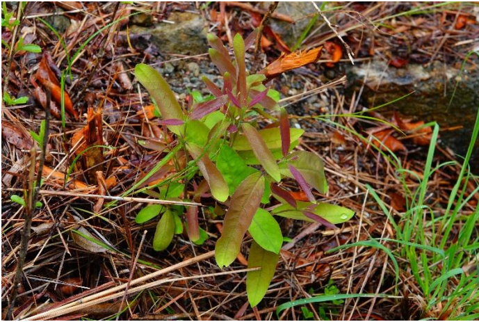
Photo 5 – Representative photo of the proposed planting species, Cratoxylum cochinchinense .