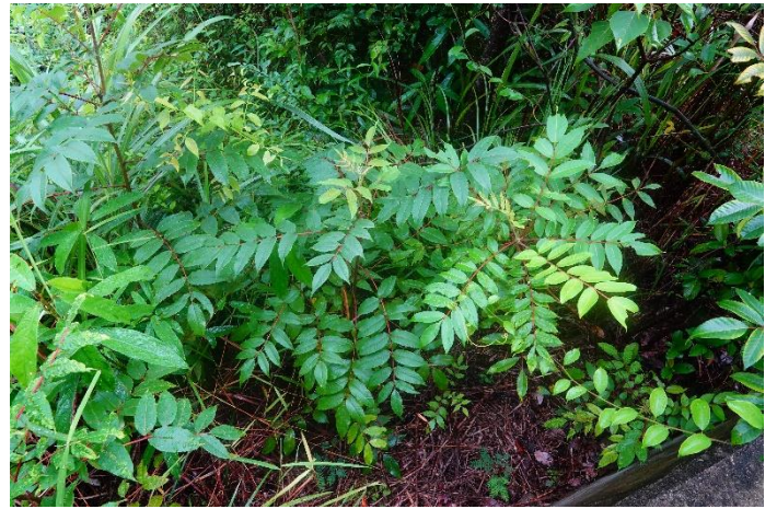
Photo 14 – Representative photo of the proposed planting species, Choerospondias axillaris .