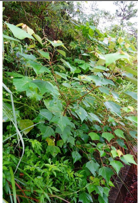
Photo 8 – Representative photo of the proposed planting species, Mallotus paniculatus .